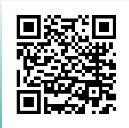
The Council Bluffs Public Library Local History page