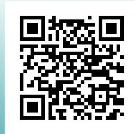
Council Bluffs Digital Archive